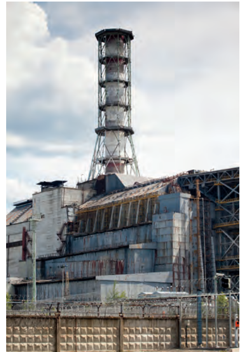
Reactor 4 Chernobyl Nuclear Plant: The sarcophagus, is now deteriorating, increasing the risk of its radioactive remains leaking out into the environment

The inner cladding completes the soffit and forms a plenum (annular space) between the outer cladding deck. Steel sheets span between the structural purlins and are sealed as an air